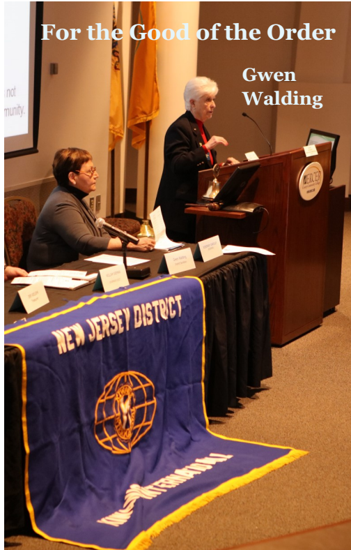
For the Good of the Order