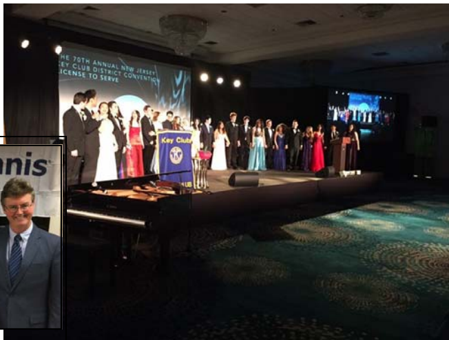
All dressed up with some place to go! Key Club officers glam it up at their annual convention. This year it was once again held in Long Branch, NJ. Congratulations to outgoing as well as incoming Key Club members.