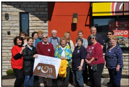
It takes a team of Kiwanians and Key Clubbers for a successful event!

T ake a restaurant that supports their community, add some committed Kiwanis Family members and you have a recipe for a relatively easy fundraiser. Applebee's Restaurants offer a "Flapjack Fundraiser" to community organizations. Just pay a flat fee for each guest and then guarantee 100 tickets to be sold and the profit is yours! The Clark club—with a profitable ad journal and "opportunity baskets," made over $5,000 at their April event.